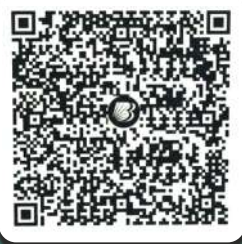
Payment QR Code

Bank Branch: JACOB CIRCLE BRANCH, Mumbai 400 011